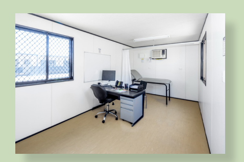
Furnished First Aid Room

To enhance your modular building experience, please contact your local Ausco representative for information about our 360° Solutions range of additional products and services.