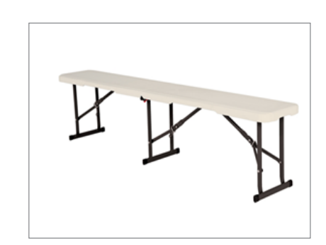
Bench Seat Bi Fold